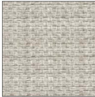
Mercury - 020