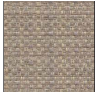
Storm - 050