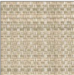
Harvest - 030