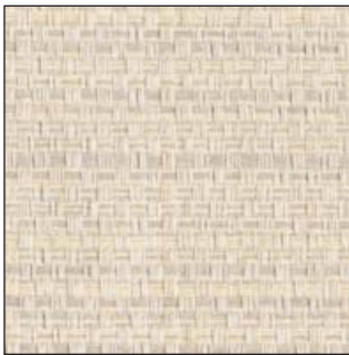
Ivory - 010

(Colors Shown on Chart are Approximate Match to Material.)