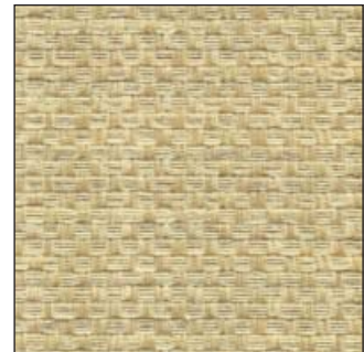
Spring - 070