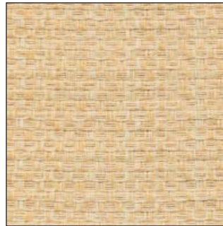
Tuscan - 040