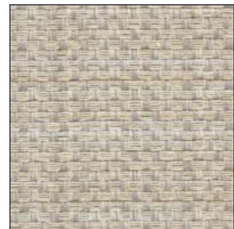
Alabaster - 021