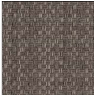
Graphite - 060